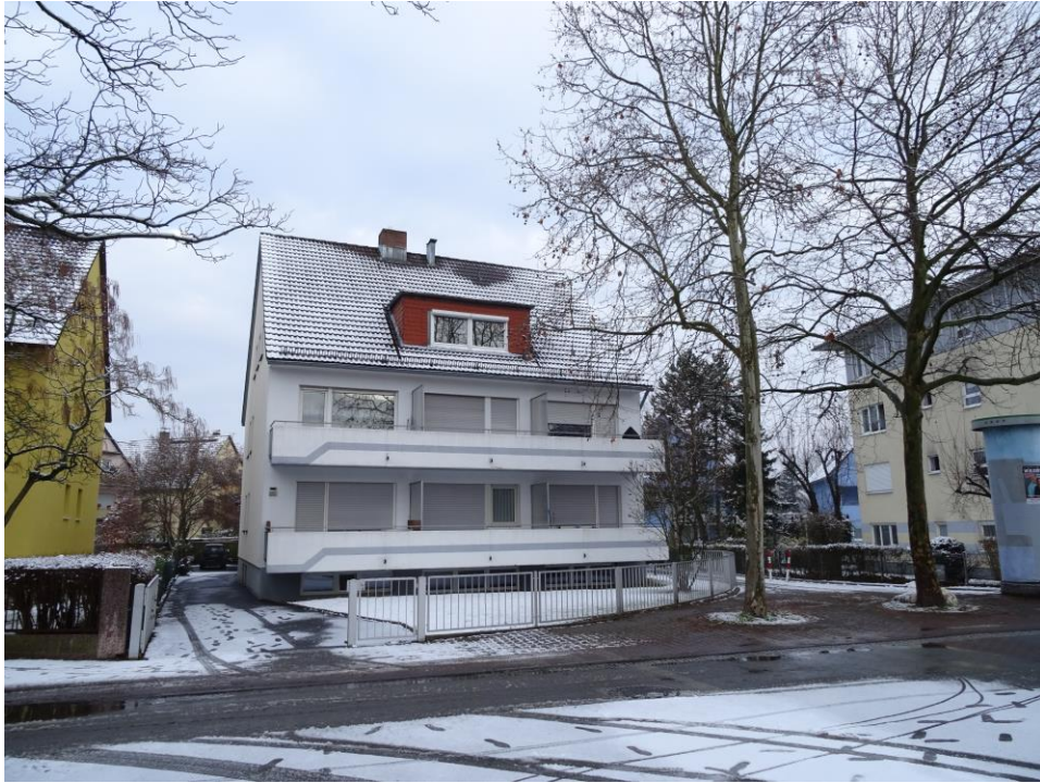
That's my balcony