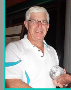
Nearest to the Pin - 1.8 m Glen (Pocksia)